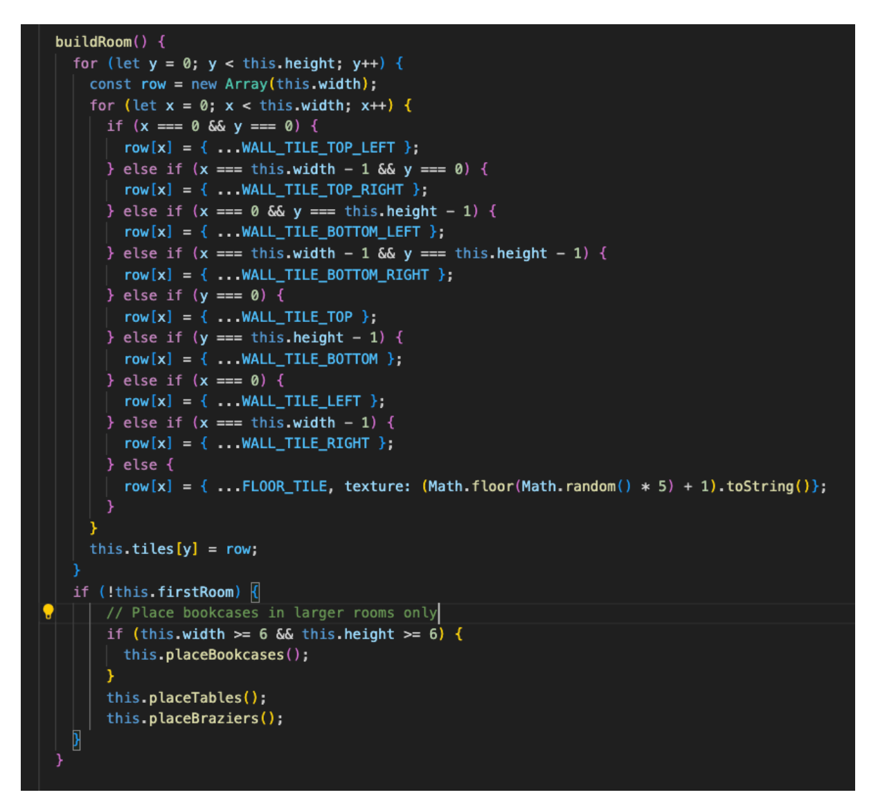
(Fig.4, The buildRoom method)

For example (Fig.4), the buildRoom method was expanded to draw tiles in each of the four corners, in addition to this, as long as it is not the firstRoom (the room that the player starts in) then it will also call the placeBookcases(), placeTables() and the placeBraziers() methods.