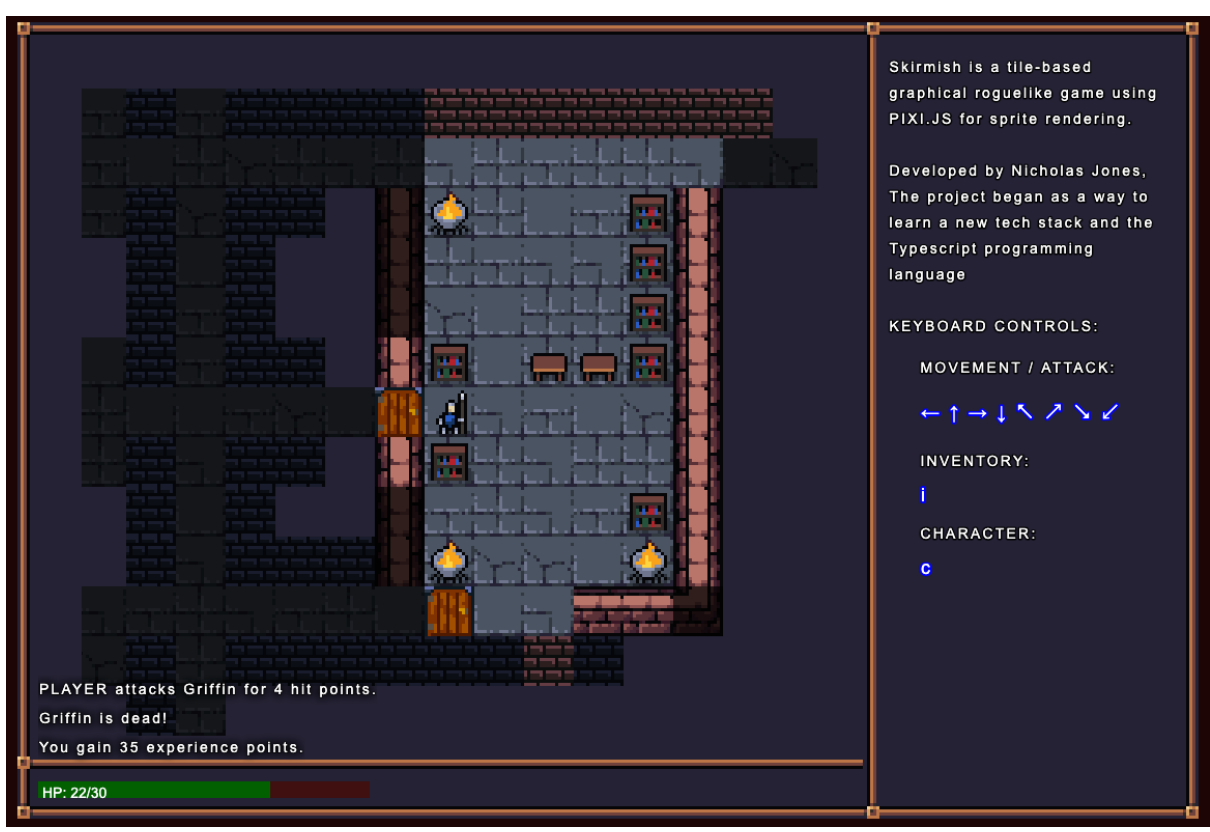
After Skrimish Proejct using sprite graphics and textures.