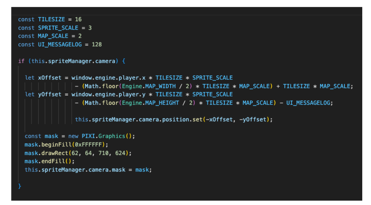
(Fig.2, repositioning the camera to center on the player)

The approach decided for this was to render all the textures and sprites on their own PIXI.Container (camera) that the x and y location of the camera would be set by subtracting the calculated offset based on the players location.