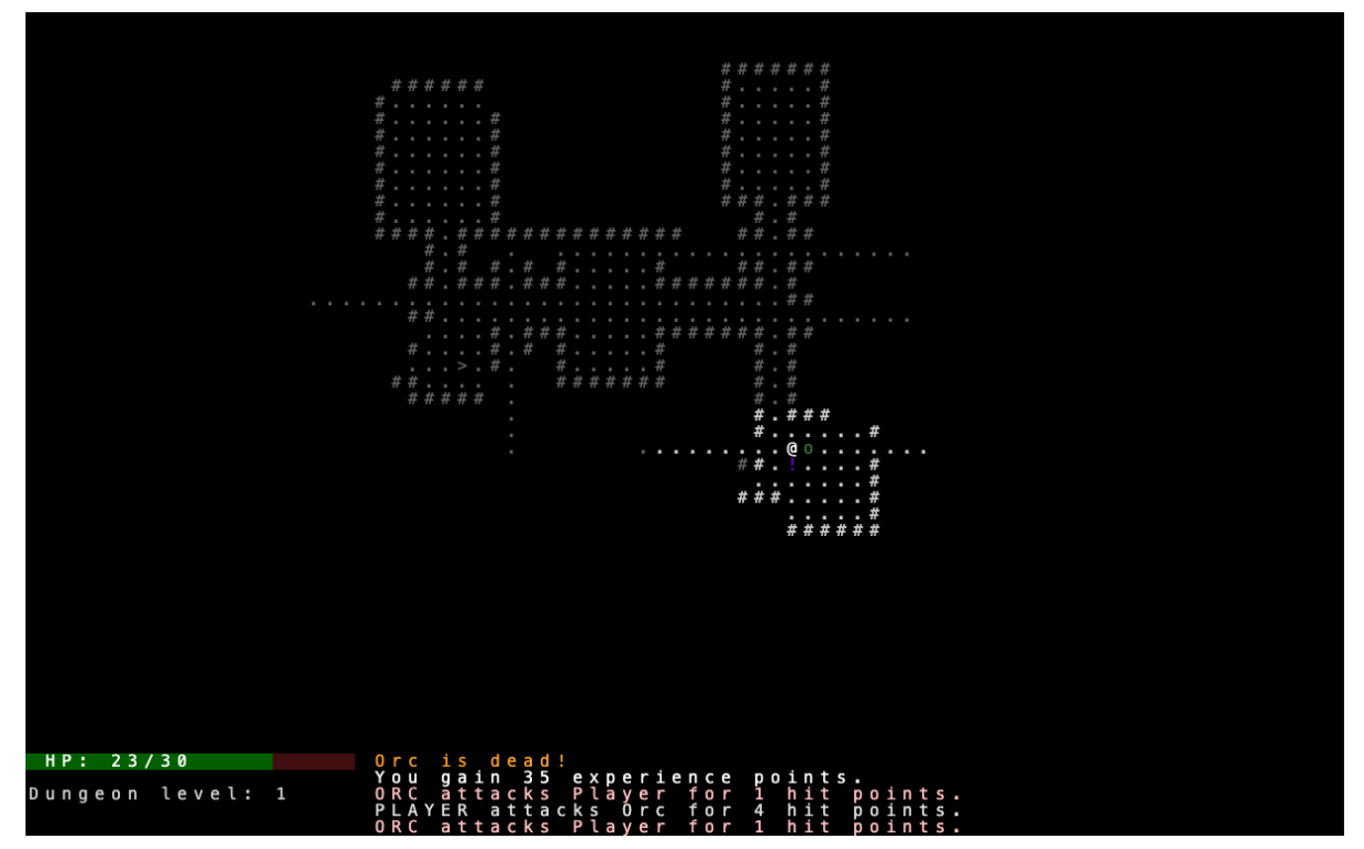
A typical ASCII character level, from the ROT.js tutorial, before the Skirmish Project.